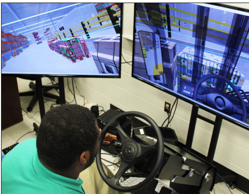
A resident operates a forklift simulator at J. Sargeant Reynolds Community College.